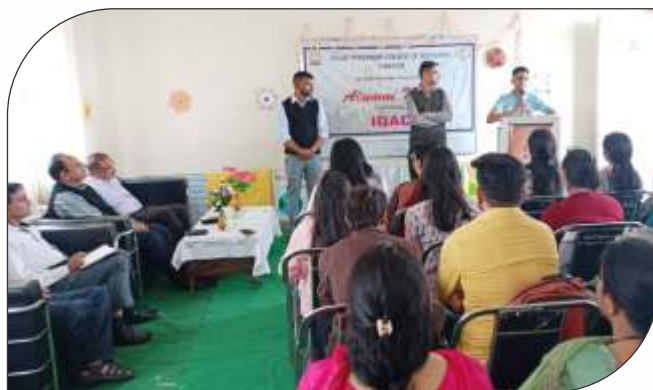
Alumni Meet -26th March 2025