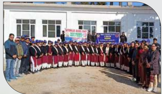
Principal, Staff & Trainee Teachers during World Aids Day Dec. 02, 2024