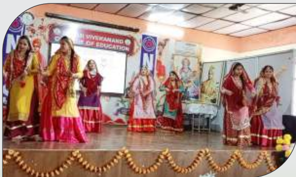
Trainee Teachers Performing During Talent Hunt Function on Nov. 30, 2024