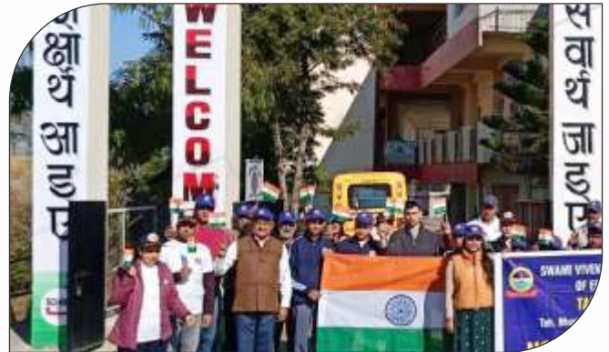
Chairman, Principal, Staff & Trainee Teachers during Celebration of Republic Day Jan. 26, 2025