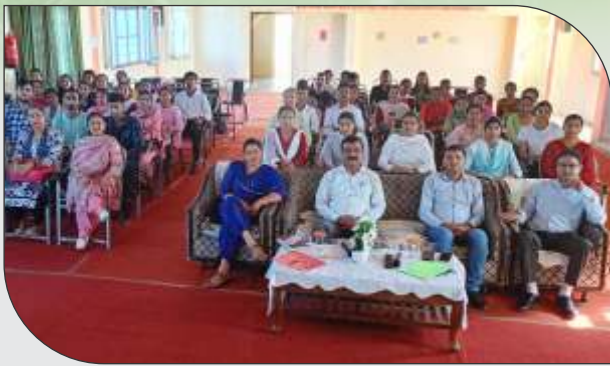
Induction Programme for B.Ed. Session 2024-2026 on Sep. 20, 2024