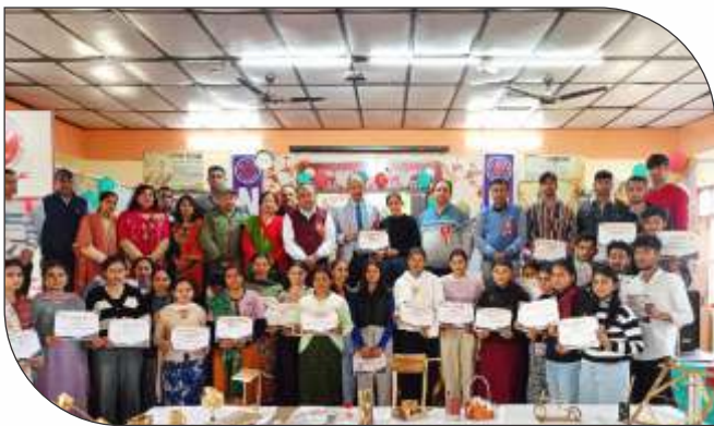
3-Days Workshop on Art & Craft Feb. 17, 2025 to Feb. 19, 2025