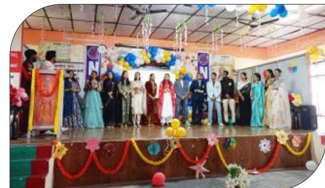
Freshers Party of D.El.Ed. March 03, 2025