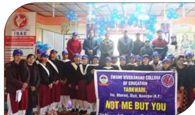
Principal, Staff & Trainee Teachers on National Science Day Feb. 28, 2025