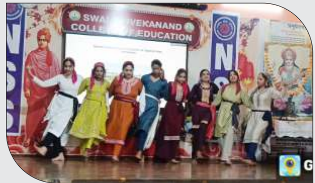
Trainee Teachers Performing During Talent Hunt Function on Nov. 30, 2024