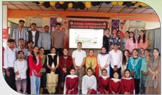
Induction Programme For D.El.Ed Trainees on Nov. 4, 2024