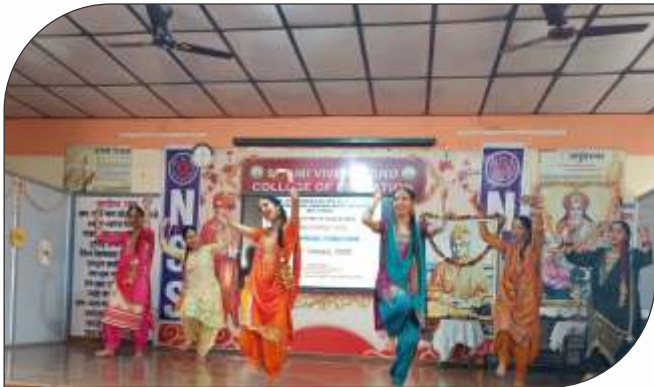
Trainee Teachers Performing on Annual Function on Jan. 12, 2025