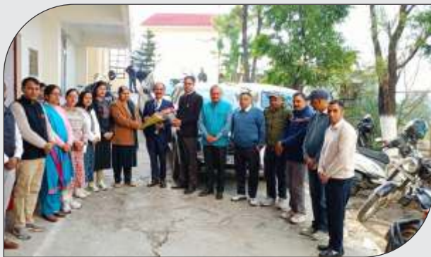
Chairman, Principal & Staff Welcome the Chief Guest on Talent Hunt Function on Nov. 30, 2024