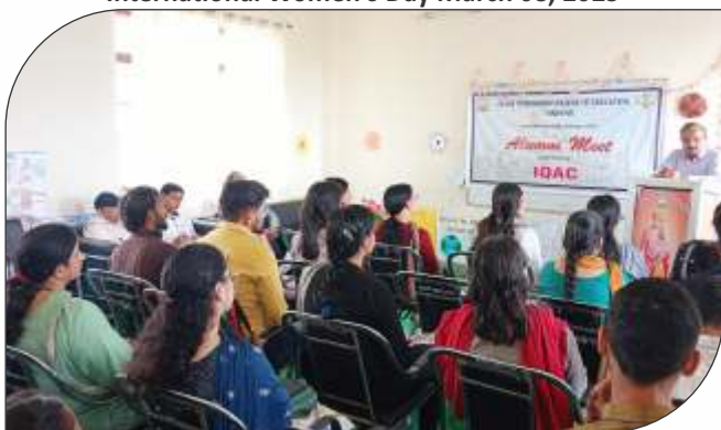
Alumni Meet -26th March 2025