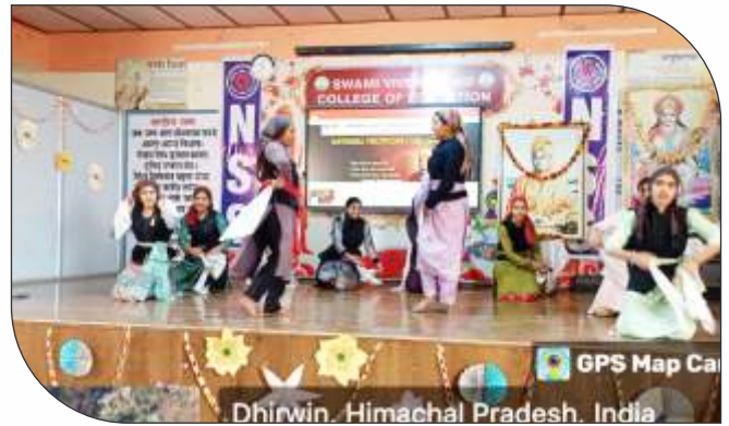
Trainee Teachers Performing on National Youth Day on Jan. 12, 2025