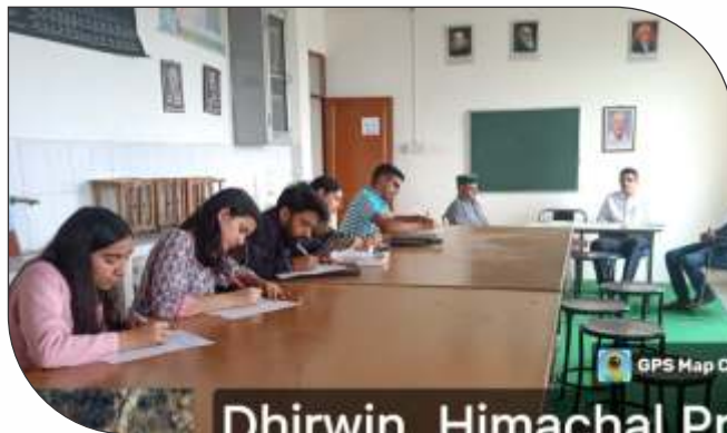
A Campus Interview Was Organised at Swami Vivekanand College of Education on March 26, 2025